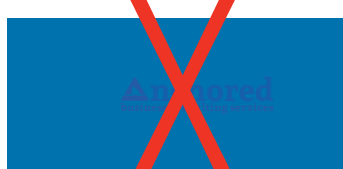
Little contrast with background