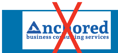
Logo boxed in

Color version should be used whenever possible. Optimal background color for logo placement on white or light warm color background. Logo should never be boxed in or not show contrast with background. When this occurs use reverse version of logo or the one color logo.