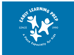
use reverse option