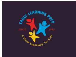
Do not Box In Logo