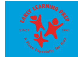
one color warm option