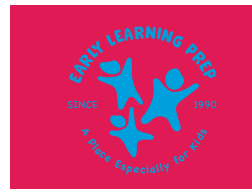
one color cool option