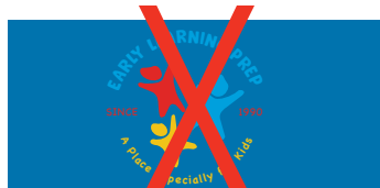
Little contrast with background