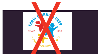
Logo boxed in

Color version should be used whenever possible. Optimal background color for logo placement on black, dark purple, light purple, orange or white. Logo should never be boxed in or not show contrast with background. When this occurs use reverse version of logo or the one color logo.